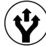
Überholen rechts & links overtaking right & left