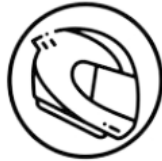
Helmpflicht Helm on H.A.N.S. system